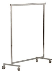
Art. 30001 Wardrobe rack chrome 22,05 €