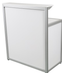
Art. 42305 Counter with composition 72,75 €