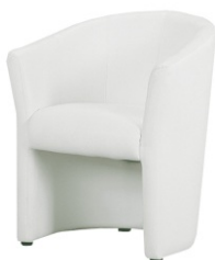
Art. 15000/15100 Club armchair black or white 42,95 €