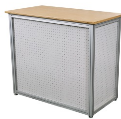
Art. 42451 Counter Magic 113,40 €