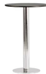
Art. 29080/29090 High table chrome/wh or bl 31,30 € / 33,60 €