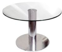
Art. 27050 Coffee table chrome/glass 45,10 €