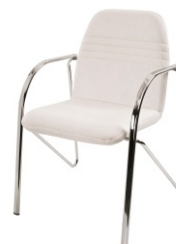
Art. 15604 Conference armchair 24,15 €