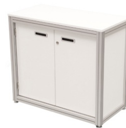
Art. 50020/50018 Sideboard white or black 48,20 €