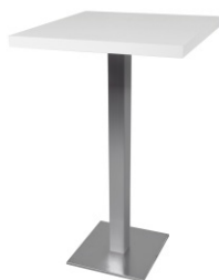
Art. 29120/29125 High table stainless steel w or b 46,60 €