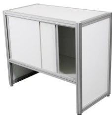
Art. 42295 Counter 62,30 €