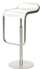
Art. 16022 Bar stool LEM white 57,10 €