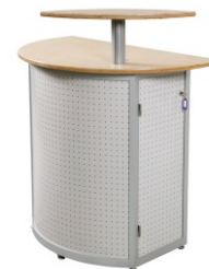
Art. 50631 Computer high desk 128,10 €