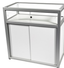
Art. 50111 Table glass cabinet 149,30 €