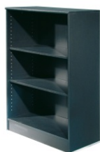
Art. 50206/50207 Filing shelf wh or bl, H 110 20,30 €