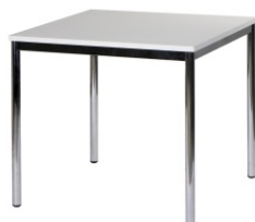
Art. 21001/21002 Meeting table white or black 80x80 22,10 €