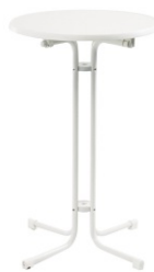
Art. 29010 High table white, foldable 20,30 €