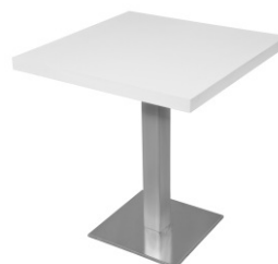
Art. 26120/26125 Bistro table stainless steel wh/bl 41,20 €