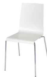
Art. 12680 Chair Kuadra 10,10 €