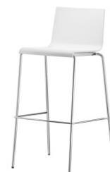
Art. 16680 Bar stool Kuadra white 19,85 €