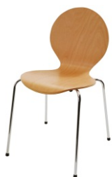
Art. 12030 Chair Balloon beech 12,40 €