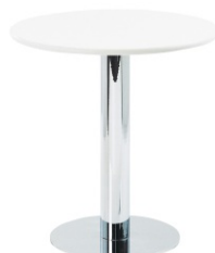
Art. 26000/26010 Bistro table chrome/wh or bl 19,95 € / 21,50 €