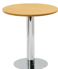
Art. 22104 Bistro table chrome/beech 26,30 €