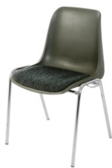
Art. 10130 Shell chair cushioned 7,45 €

Tel. +49 30 684086-0 info@expofair-berlin.de www.expofair-berlin.de