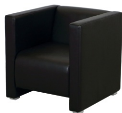
Art. 15015/15016 Armchair Qubo white or black 82,30 €