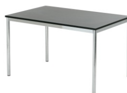
Art. 21021/21022 Meeting table white or black 120x80 24,70 €