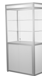
Art. 50121a Glass cabinet H 200 lit-up 254,80 €