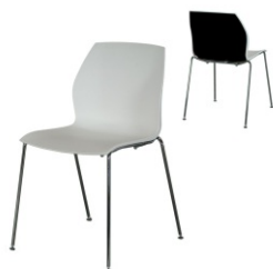
Art. 12112/12113 Chair Kalea wh/bl or wh/red 19,30 €