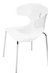
Art. 12070 Chair Vanilla 30,25 €