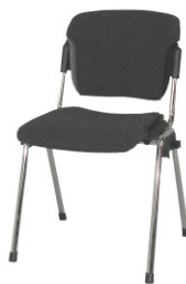
Art. 10261 Chair Flou anthracite 12,60 €