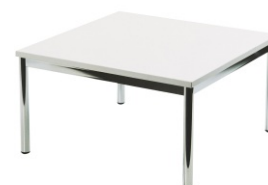
Art. 21081 Coffee table chrome/white 22,10 €